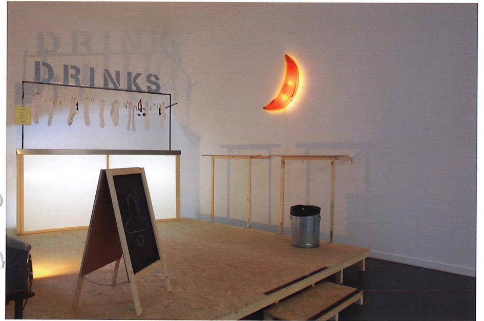
Café Bel 2014